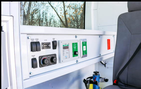
Rear Heat & Air Conditioning controls in rear compartment. Air is directed at the discretion of staff for ultimate comfort. Control panel includes power outlets and lighting controls.