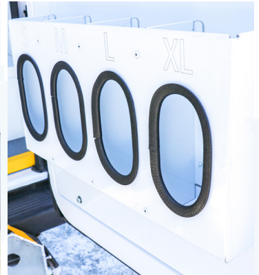
Medical Glove Storage