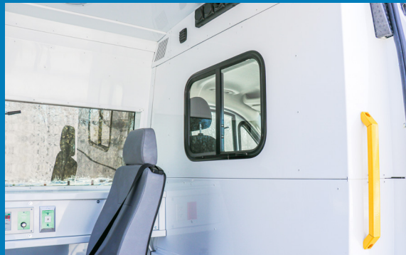
Cab divider available with or without window. Available with passthrough and sliding door options.