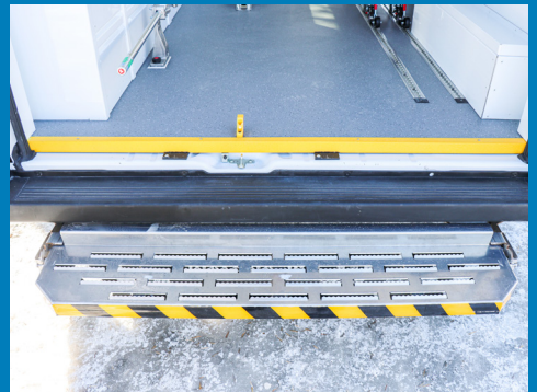
Serrated anti-slip running boards prevent ice and snow buildup