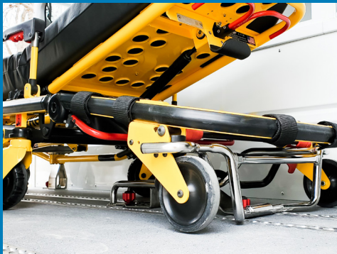
Stretcher securement for major brands including Ferno and Stryker