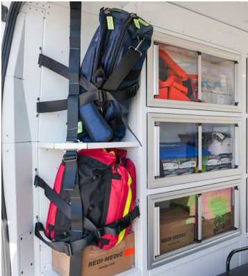
First responder kit bag storage area.

All medical equipment has a designated storage space to make it easily accessible. Additional options like a folding desk space or fridge are available.