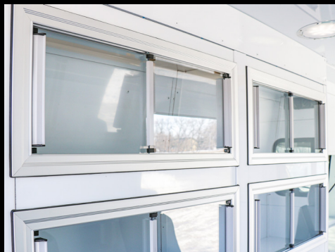
Easy access cabinets with durable, transparent slide and click fronts