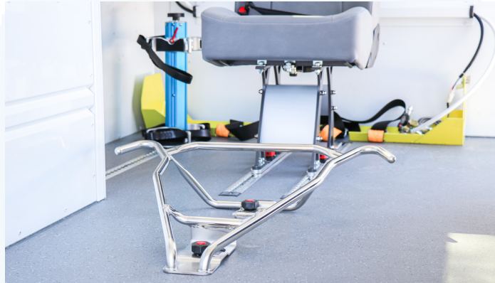
Oxygen bottle holders, and stretcher securement.